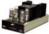
NAT Se3 Single-Ended Monoblock Amplifiers

(click on a product to view or scroll down):