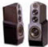
Egglestonworks Andra II Loudspeakers