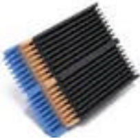
Acoustics First Sound Control Wall Treatment